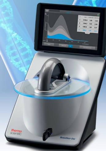
NanoDrop One Spectrophotomer

The Acclaro-corrected results (green bars) demonstrate that greater accuracy is achieved in the determination of DNA concentration when using the Acclaro feature. The Acclaro algorithm uses the full spectral data in conjunction with multivariate mathematics to specifically determine the concentration of DNA in a DNA/RNA mixture. The DNA concentrations obtained after Acclaro correction were much closer to the those obtained by using a DNA-specific fluorescence dye.